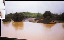
RED CROSS SOCIETY OF CHINA

▶ Guizhou province, China. Like other major natural disasters, floods are not only immediately devastating but also have destructive consequences in the long term. Emergency needs include evacuation, distribution of food, medicine and essential household items as well as provision of temporary shelter. Destruction of crops, top soil and irrigation systems or of important infrastructure that often accompanies severe flooding means that continued assistance, especially food relief, may be necessary.