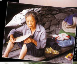
RED CROSS SOCIETY OF CHINA

▶ Guizhou province, China. Like other major natural disasters, floods are not only immediately devastating but also have destructive consequences in the long term. Emergency needs include evacuation, distribution of food, medicine and essential household items as well as provision of temporary shelter. Destruction of crops, top soil and irrigation systems or of important infrastructure that often accompanies severe flooding means that continued assistance, especially food relief, may be necessary.