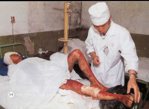
HONG KONG RED CROSS

▲ Jiangxi province, south-east China. In China this year, some 92 million people – almost twice the annual average over the last 25 years – had been affected by floods two months after the monsoon rains began at the end of May. This is the sixth consecutive year that China has experienced massive flooding and direct economic losses were estimated in July to be on the order of SFr 8.3 billion.