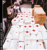
RED CROSS SOCIETY OF CHINA