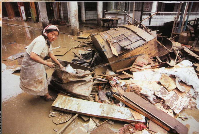
HONG KONG RED CROSS

IN THE LAST 25 YEARS, ON AVERAGE FLOODS HAVE AFFECTED MORE THAN 56 MILLION PEOPLE WORLDWIDE EVERY YEAR. SOME 12,000 PEOPLE A YEAR ARE KILLED BY FLOODING AND APPROXIMATELY 3.5 MILLION A YEAR ARE LEFT HOMELESS.