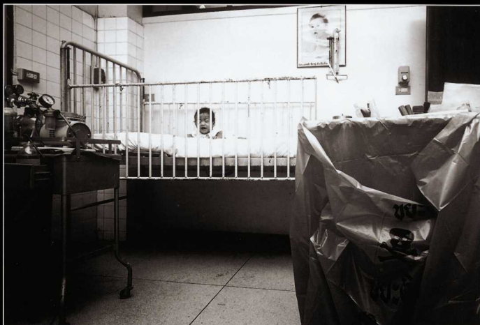
▲ Baby infected with HIV, Bangkok. In the Red Cross hospital, several wards are devoted to HIV/AIDS babies. Segregated they await their fate. Many are orphans. Their parents have already succumbed.