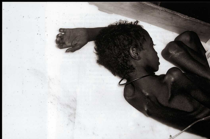
► Starving child, Baldoe. Shortly after this photograph was taken the child died, too emaciated to retain fluids, too weak to fight for life. In Somalia there was money for weapons and the fighters didn't seem to be starving. They alone had the strength to fight.